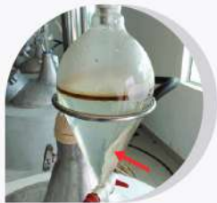
Agarwood Distilled Water